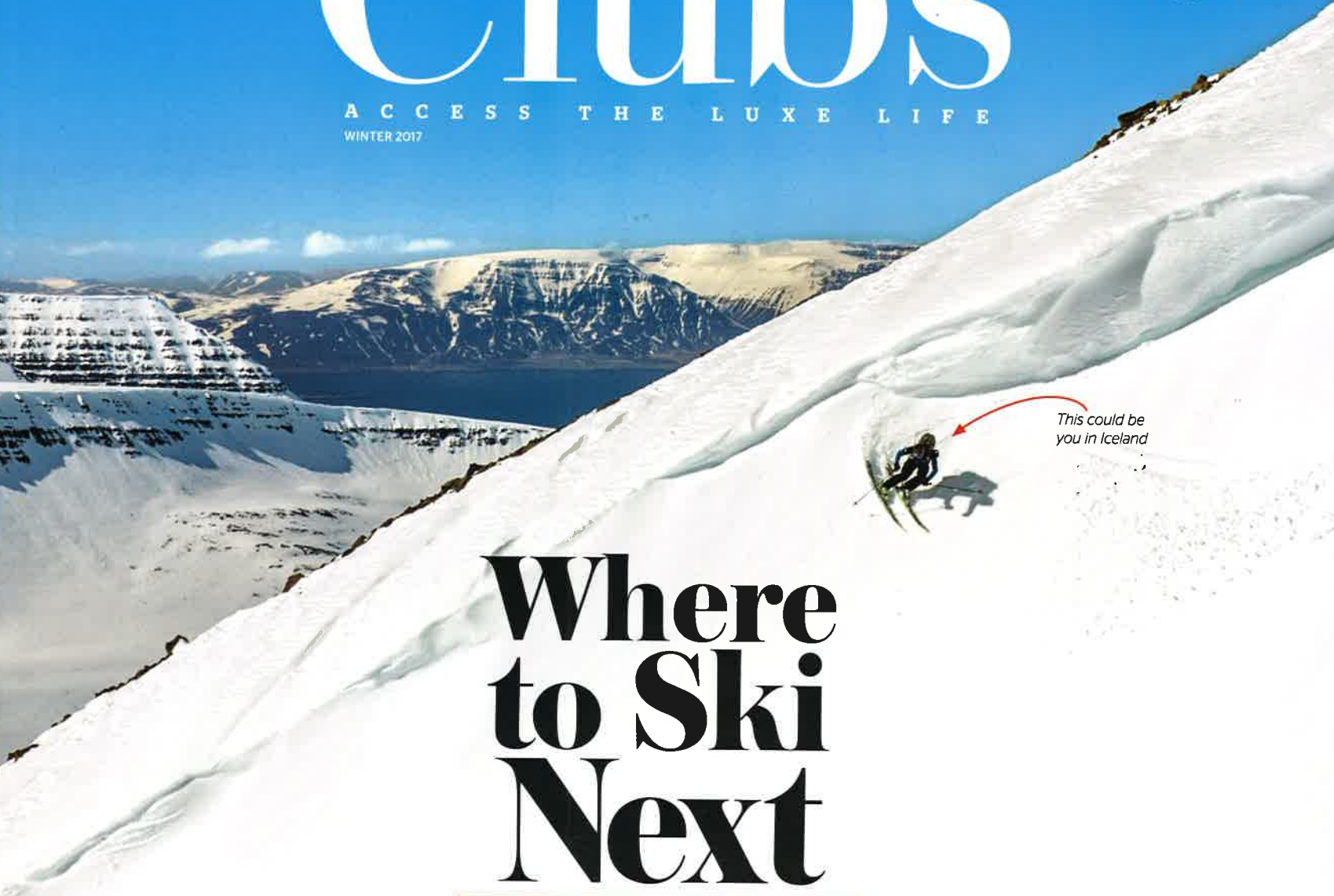
This could be you in Iceland

A C C E S S T H E L U X E L I F E WINTER 2017