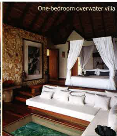
One-bedroom overwater villa