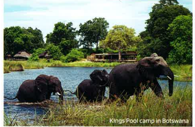
Kings Pool camp in Botswana