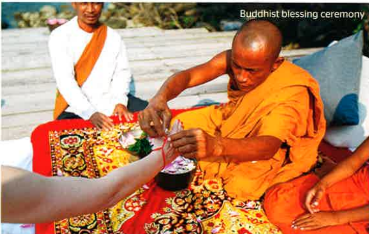
Buddhist blessing ceremony

411: From $1,098. 011-855-23-989-012; songsaa.com