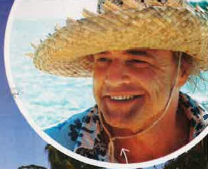
BRANDO (CA. 1970S) DISCOVERED TETIAROA WHILE FILMING MUTINY ON THE BOUNTY IN 1962.