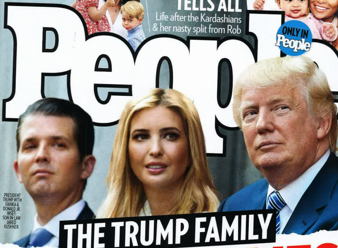
PRESIDENT TRUMP WITH IVANKA & DONALD JR. INSET: SON-IN-LAW JARED KUSHNER