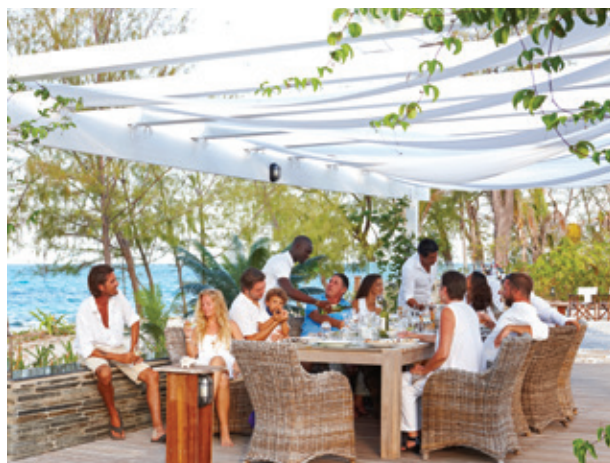
Left: Private Villa jacuzzi and luxury dining at Thanda Island in Tanzania Below: Shower with a view outside a Six Senses Zil Pasyon villa in The Seychelles Bottom: The naturally shaped Cempedak villas blend into the Indonesian wild habitat for ultimate privacy and relaxation